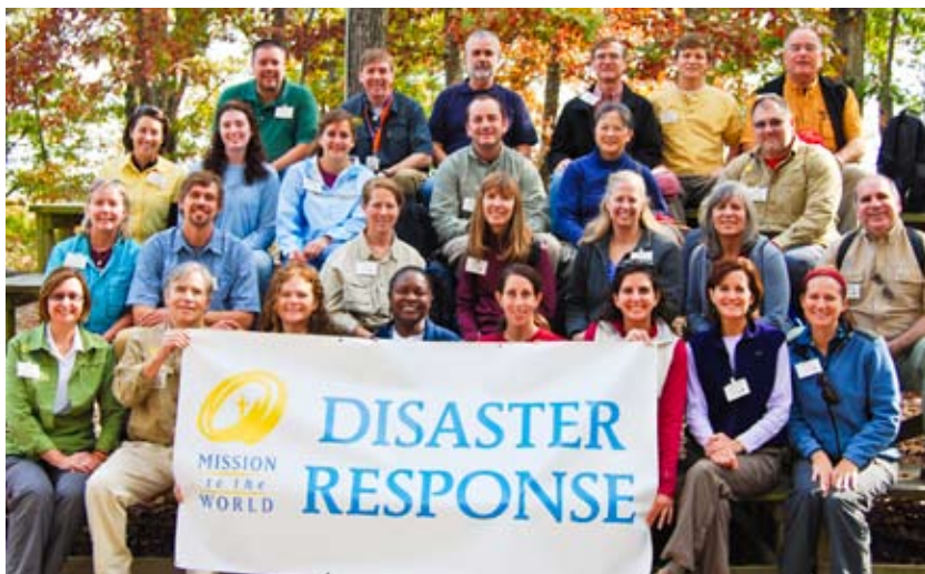
DRT participants, fall 2010