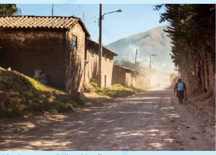
A Quechua woman walks through her village.

Operating out of a basement, the Radio Amauta team used a generator, a 250-watt transmitter, and a Lazy H antenna system to transmit Bible programs, sermons, and community