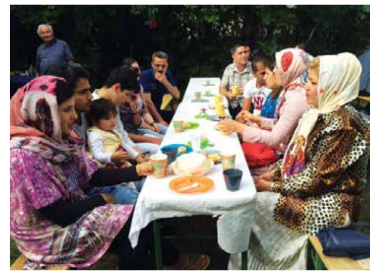
The church actively reached out to minister to refugees

God also used the 2016–2017 European refugee crisis to breathe new life into Berlin and increase the Church's influence. First,