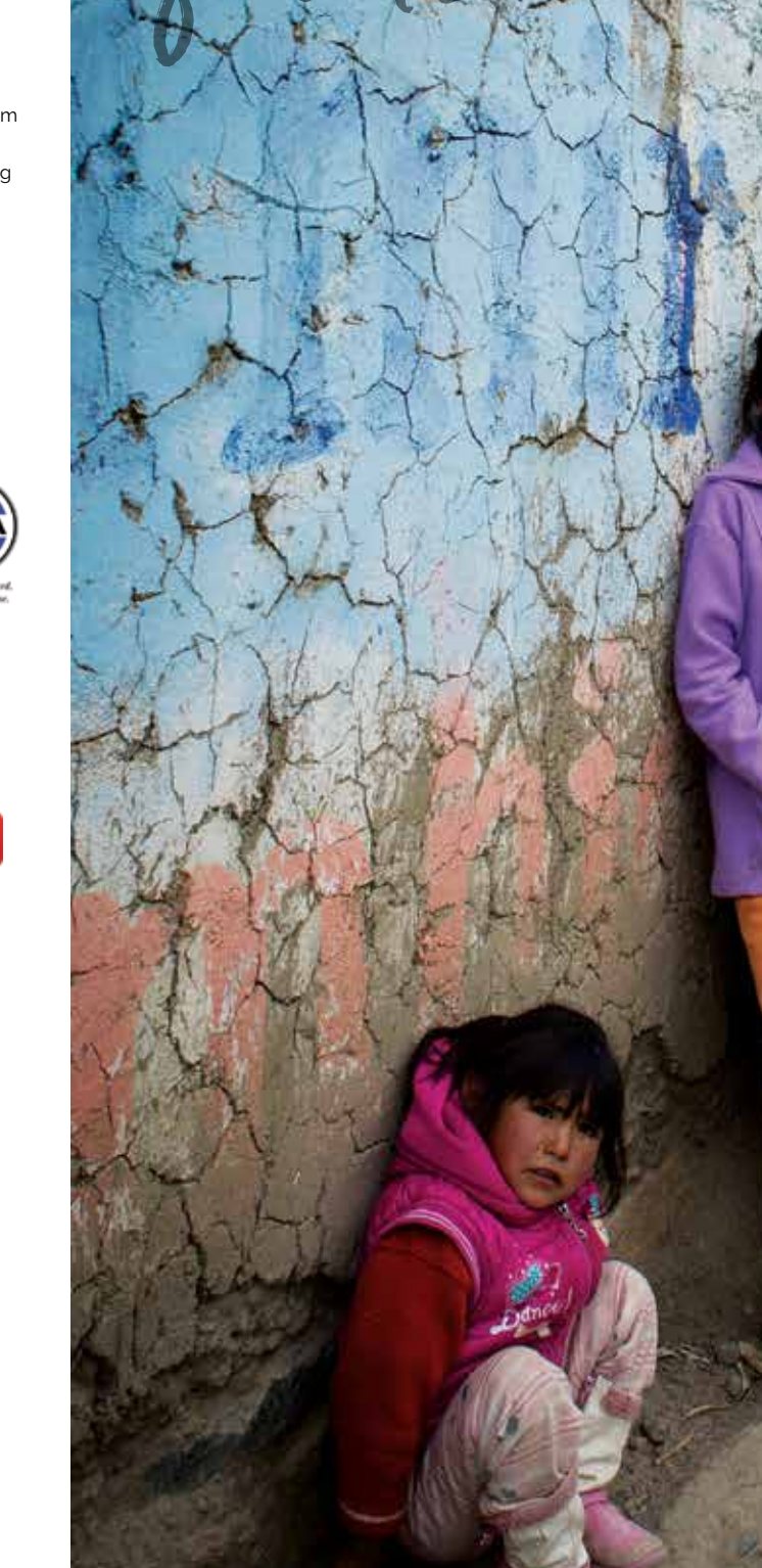
Image taken during a short term mission trip to Peru.

© Copyright 2021 by Mission to the World. All rights reserved. Material in Network may be reproduced with permission. Network requests a copy of the publication in which the reproduced article appears.